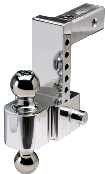
FLASH™ BALL MOUNTS

Strong enough for your heaviest toys, yet light weight and easy to use.